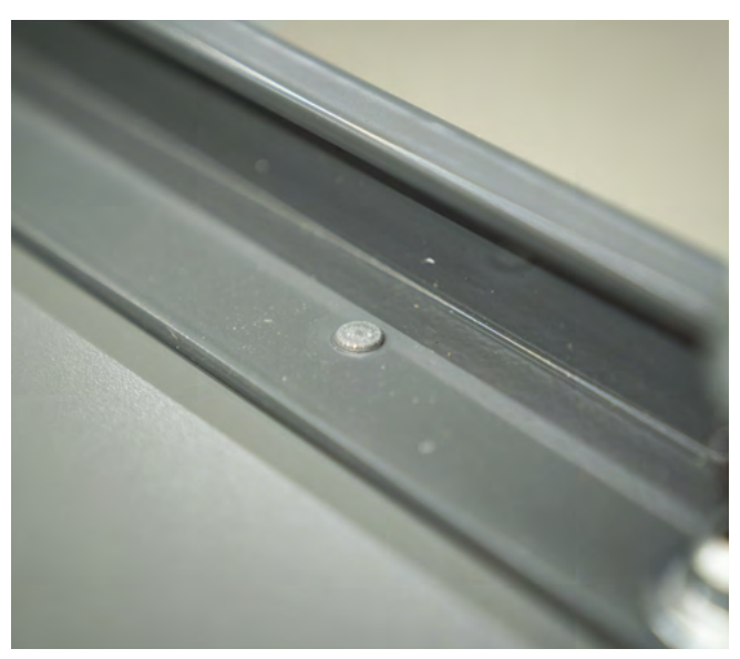
High-strength joint with RIVSET® self-pierce rivets